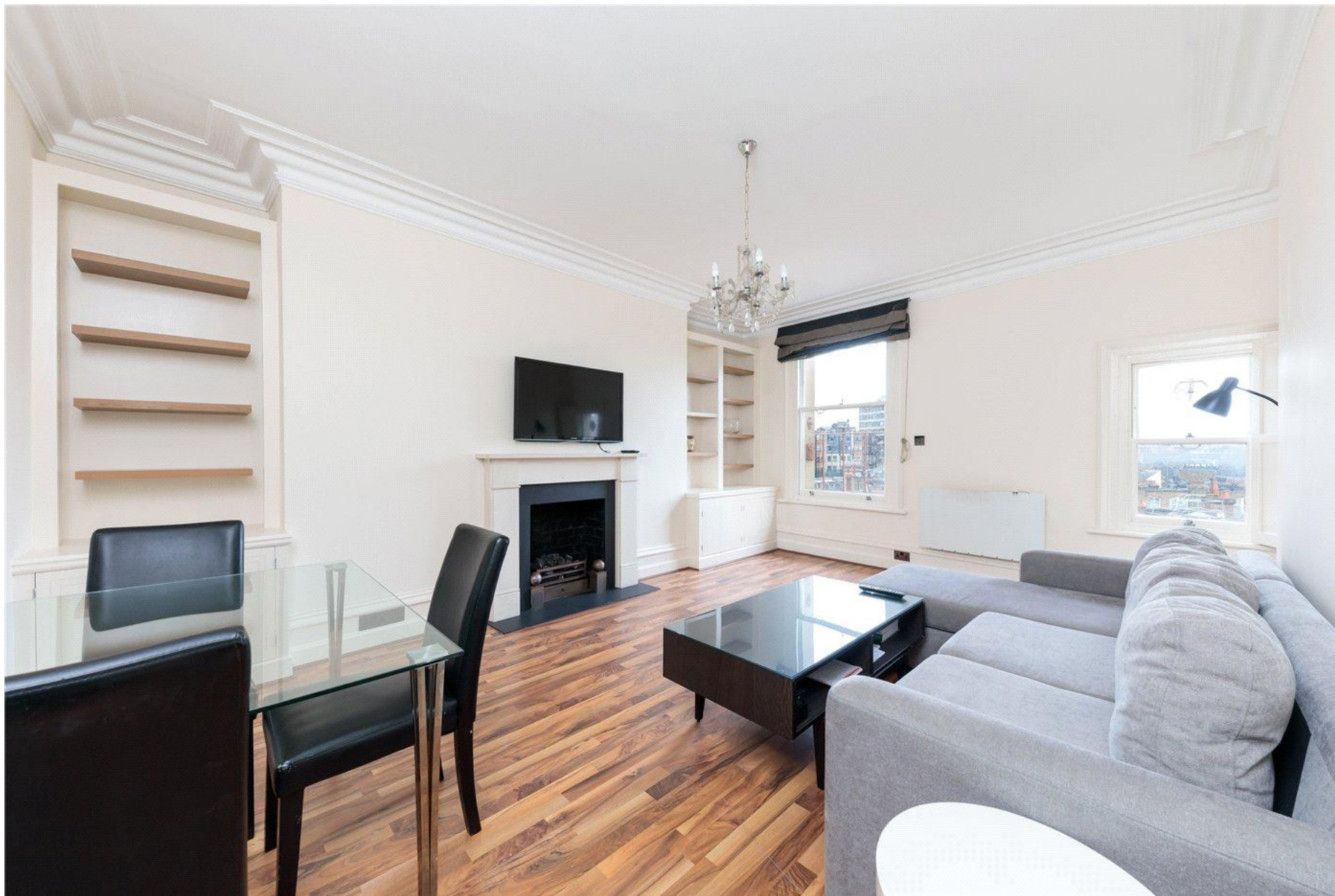
PARK MANSIONS, LONDON, SW1X £895 PER WEEK FURNISHED