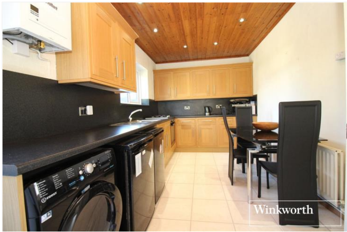
CARLTON CLOSE, HERTFORDSHIRE, WD6 £395,000 FREEHOLD