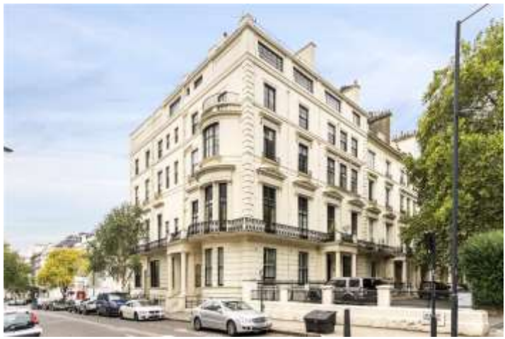
WESTBOURNE TERRACE, BAYSWATER, W2 £1,200,000 LEASEHOLD

WITH CLOSE PROXIMITY TO HYDE PARK, THE PROPERTY IS A TRULY EXCEPTIONAL APARTMENT WITH A FABULOUS ABOUT - 580 SQ FT SOUTH WESTERLY FACING ROOF TERRACE.