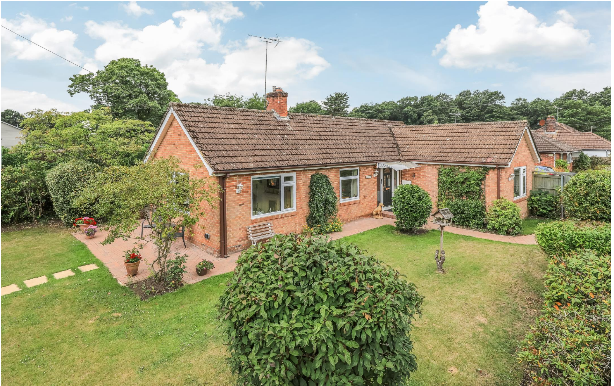
Tuscan, Hamdown Crescent, East Wellow, Romsey, SO51 6BJ