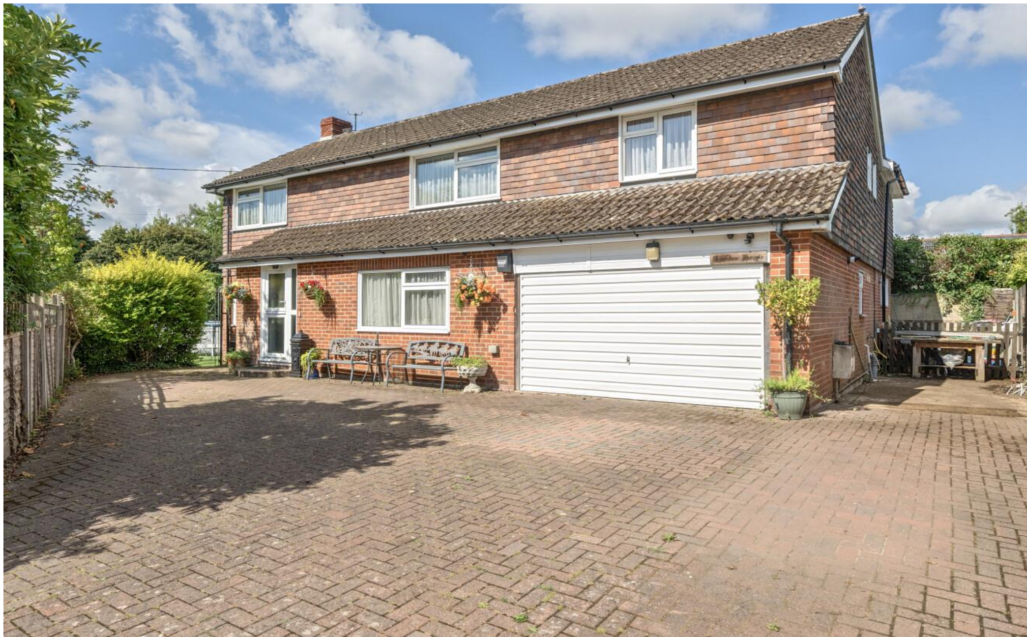
Guelder House, Lower Common Road, West Wellow SO51 6BT Guide Price £899,950