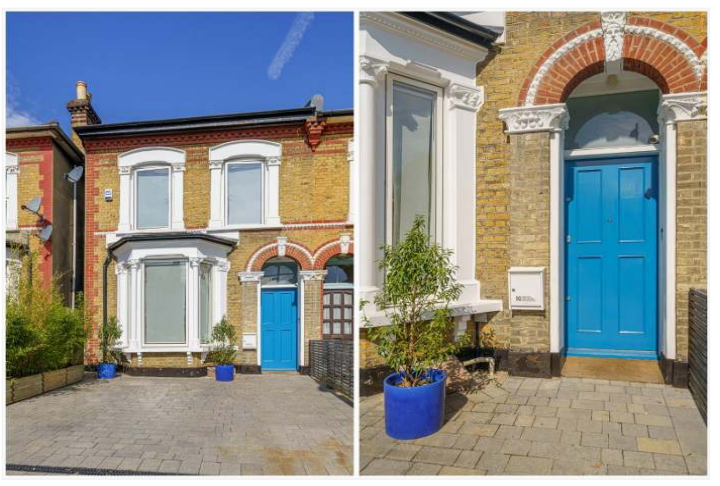
FRIERN ROAD, EAST DULWICH, LONDON, SE22 £1,800,000 FREEHOLD

A FANTASTIC SEMI-DETACHED HOME, SITUATED ON AN EXCEPTIONAL ROAD IN SE22. THIS MUCH-LOVED FAMILY HOME IS OFFERED TO THE MARKET CHAIN FREE AND IN FANTASTIC CONDITION.