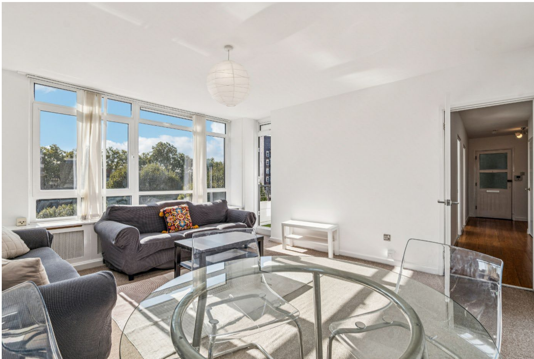
CRAVEN TERRACE, LANCASTER GATE, W2 GUIDE PRICE £895,000 SHARE OF FREEHOLD