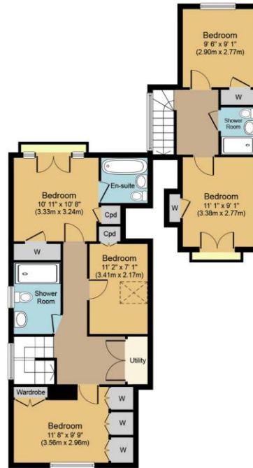
First Floor Approximate Floor Area 895 sq.ft. (83.2 sq.m.)

Whilst every attempt has been made to ensure the accuracy of the floor plan contained here, measurements of doors, windows, rooms and any other items are approximate and no responsibility is taken for any error, omission, or mis-statement. The measurements should not be relied upon for valuation, transaction and/or funding purposes. This plan is for illustrative purposes only and should be used as such by any prospective purchaser or tenant. The services, systems and appliances shown have not been tested and no guarantee as to their operability or efficiency can be given.