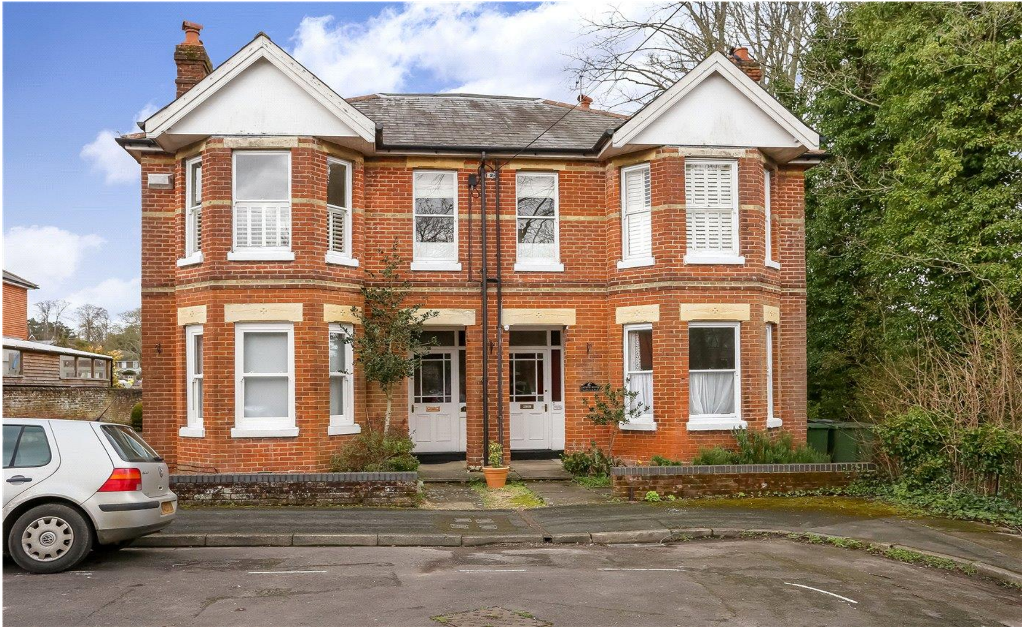
Arthur Road, Winchester, SO23