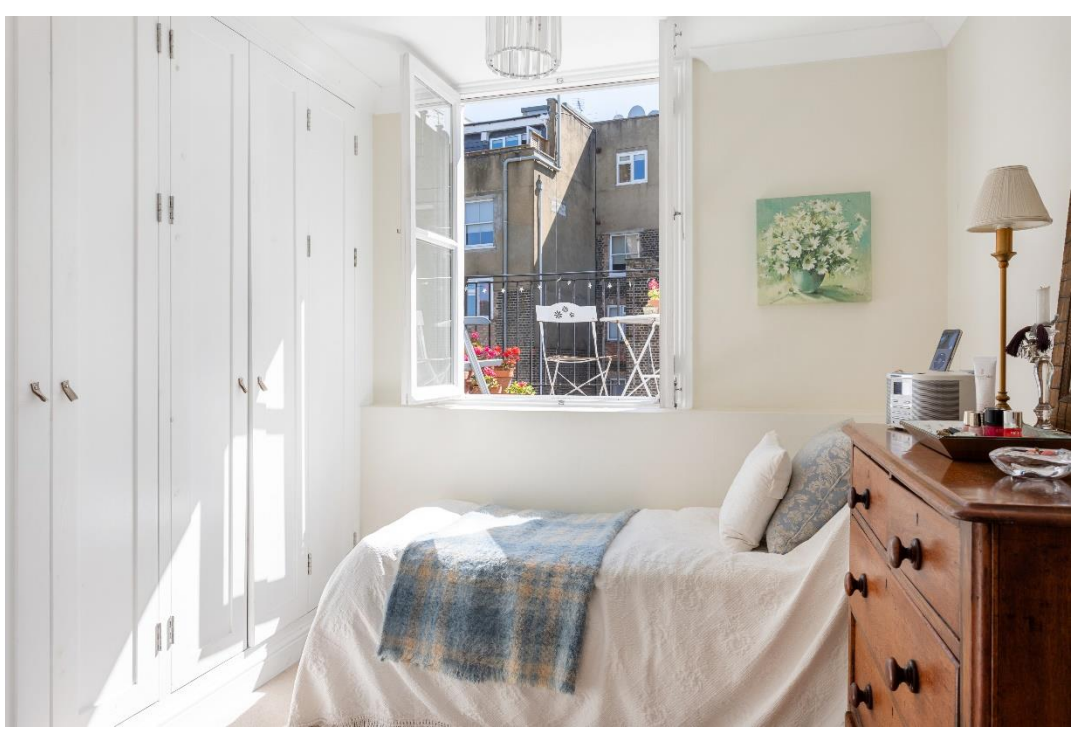
Two double bedrooms | Share of Freehold | South Facing Terrace (not demised)