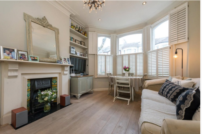
BATHURST GARDENS, NW10 £2,250 PER MONTH UNFURNISHED