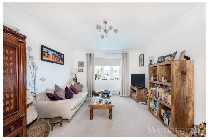
FLAT 4, SYDENHAM PARK ROAD, LONDON, SE26 £350,000 LEASEHOLD