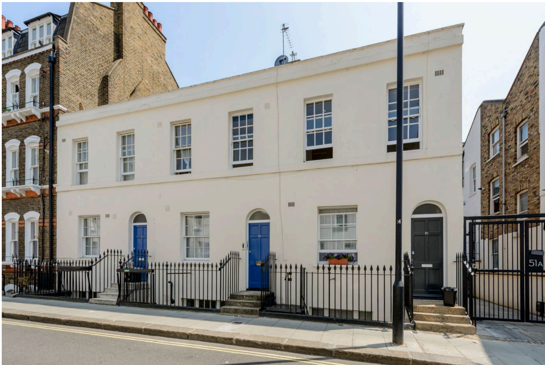
ST MICHAEL'S STREET, PADDINGTON, W2 £475,000 LEASEHOLD