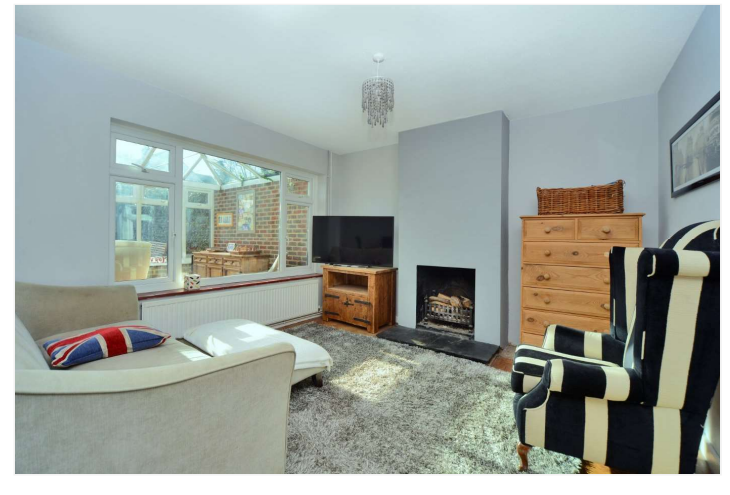
NORTHEY AVENUE, CHEAM, SURREY, SM2 OIEO £725,000 FREEHOLD

A THREE BEDROOM SEMI-DETACHED FAMILY HOME SET WITHIN A SOUGHT AFTER LOCATION AND OFFERING SCOPE FOR EXTENSION (STPP)