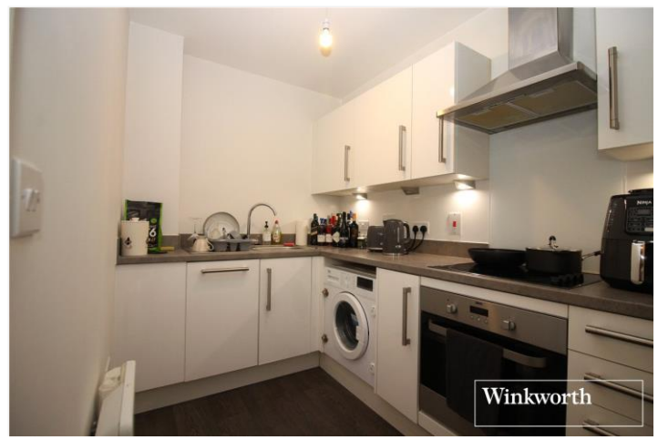
MANOR WAY, HERTFORDSHIRE, WD6 £272,000 LEASEHOLD