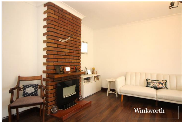
CLEVELAND CRESCENT, HERTFORDSHIRE, WD6 £830,000 FREEHOLD