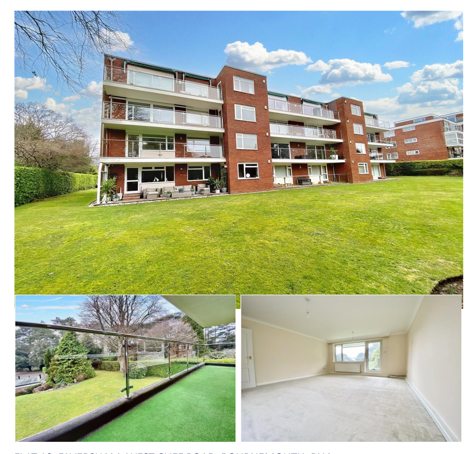
FLAT 10, FAVERSHAM, WEST CLIFF ROAD, BOURNEMOUTH, BH4