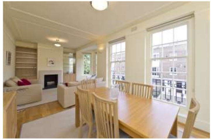
SEYMOUR PLACE, MARYLEBONE, W1H £995,000 LEASEHOLD

LOCATED IN W1H - MARYLEBONE, A LIGHT AND WELL-PROPORTIONED FIRST FLOOR TWO DOUBLE BEDROOM APARTMENT, SET IN A HANDSOME 1930'S PURPOSE BUILT PORTERED BUILDING.