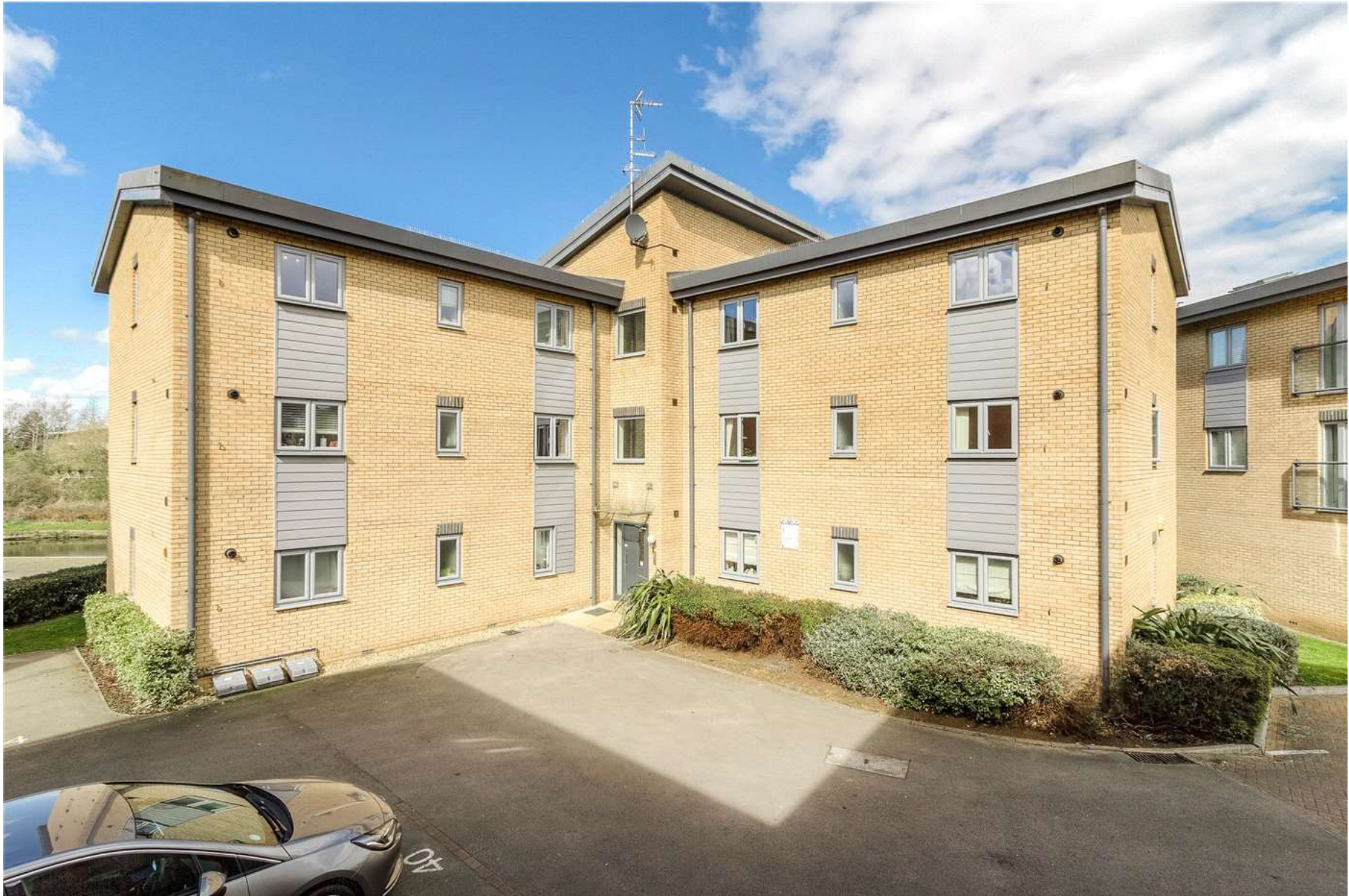
SAW MILLS COURT, NORTHAMPTON, NN4 £165,000 LEASEHOLD