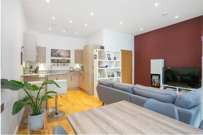
APPOLD COURT, GODFREY PLACE, LONDON, E2 £550,000 LEASEHOLD