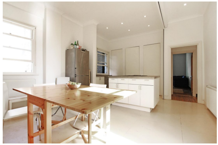
FIRST FLOOR FLAT, BASSETT ROAD, LONDON, W10 £3,683.33 PER MONTH