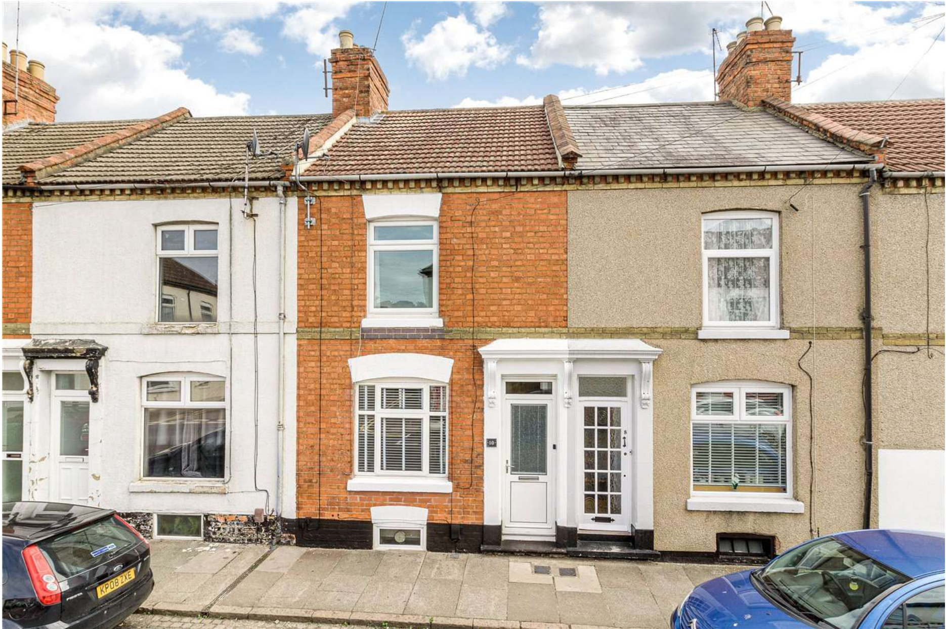
ARTIZAN ROAD, NORTHAMPTON, NORTHAMPTONSHIRE, NN1 £210,000 FREEHOLD