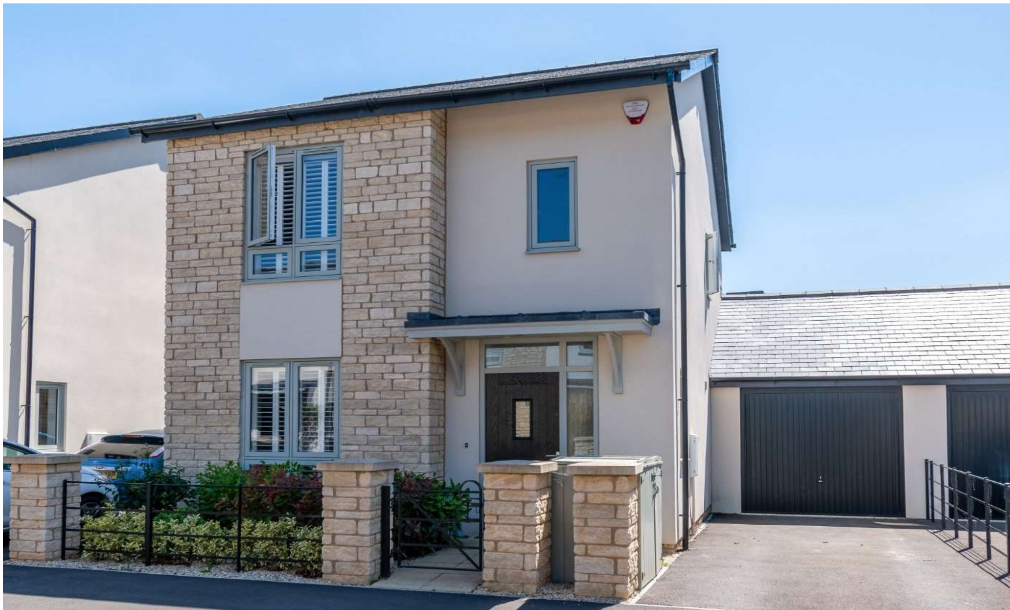
BECKFORD DRIVE, BATH, BA1 £550,000 FREEHOLD