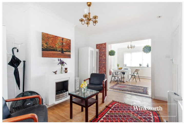
ENGEL PARK, MILL HILL EAST, LONDON, NW7 OFFERS IN THE REGION OF €800,000 FREEHOLD