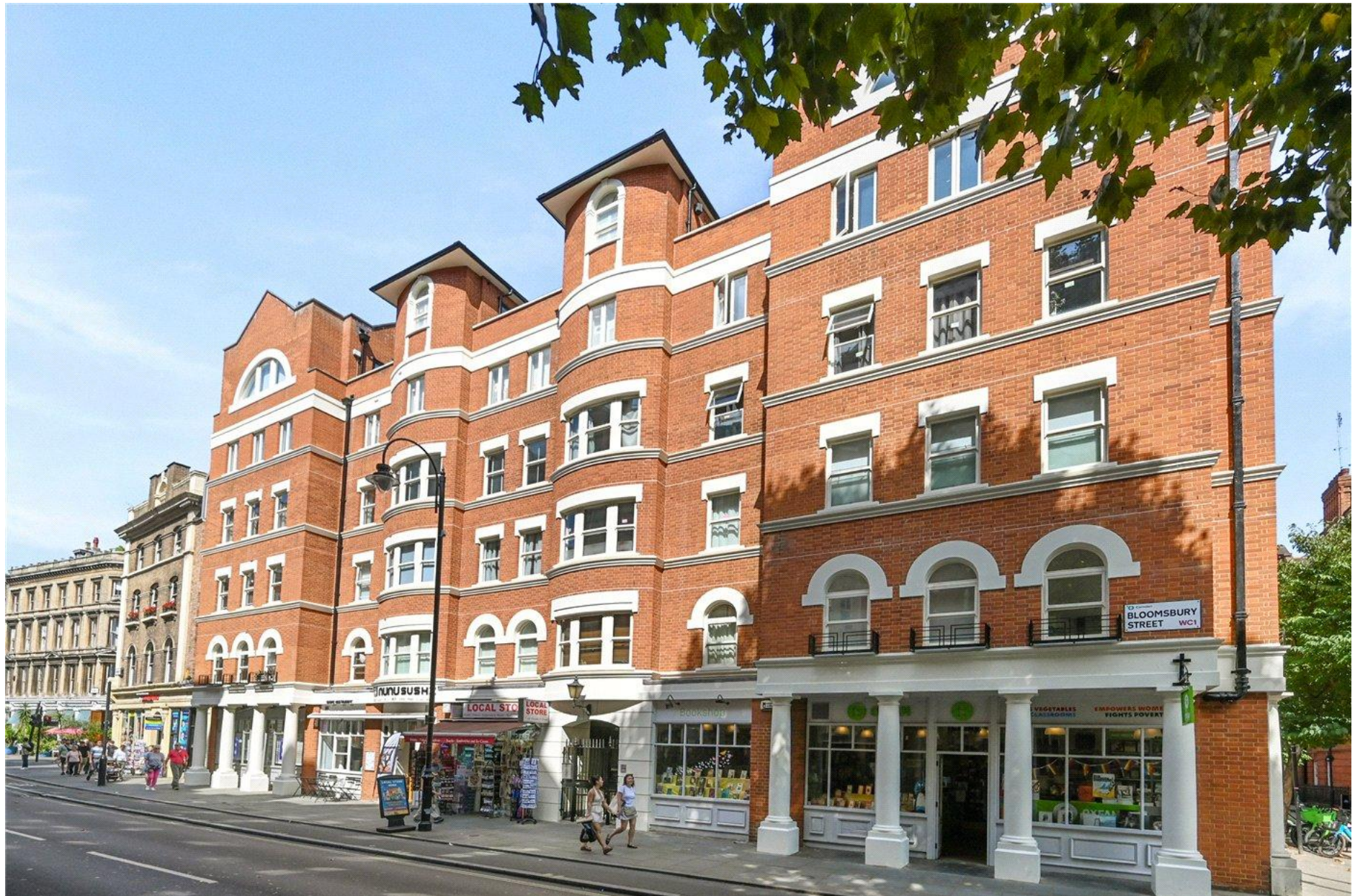
BLOOMSBURY PLAZA, BLOOMSBURY STREET, LONDON, WC1B £625,000 LEASEHOLD APPROX. 110 YEARS REMAINING