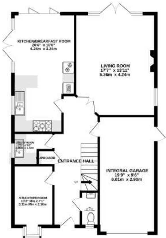
GROUND FLOOR 827 sq.ft. (76.8 sq.m.) approx.