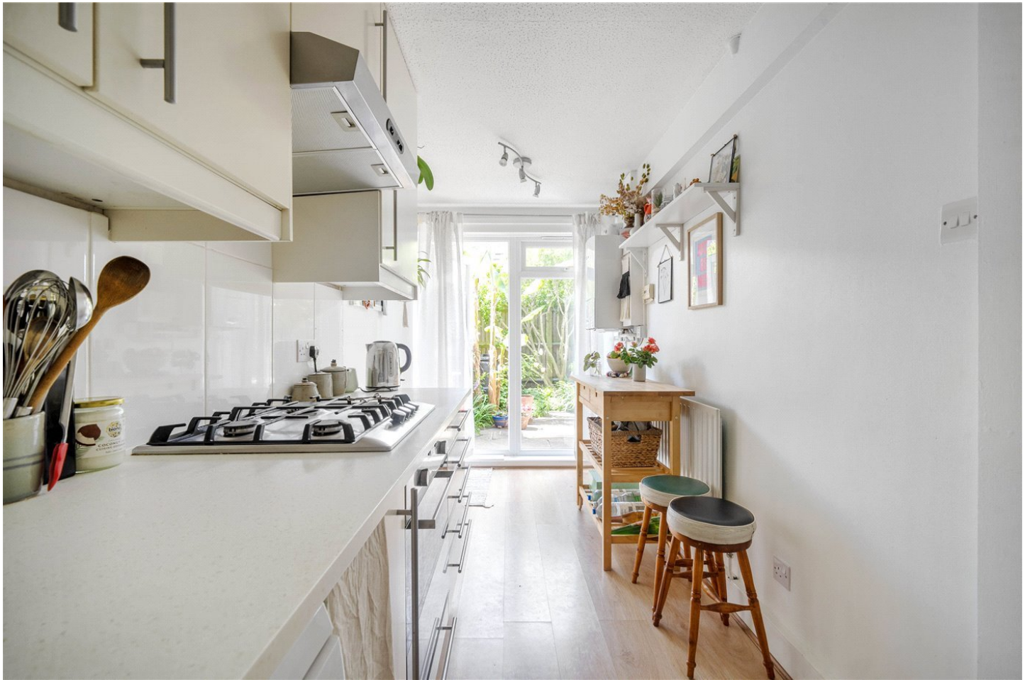
DESCRIPTION: Beautiful ground floor apartment with a private garden located a short stroll from Forest Hill & Sydenham.