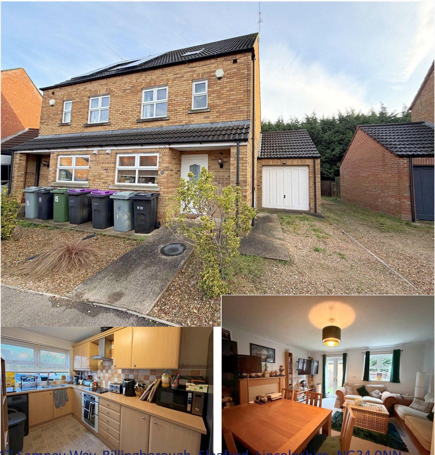
17 Sampey Way, Billingborough, Sleaford, Lincolnshire, NG34 0NN