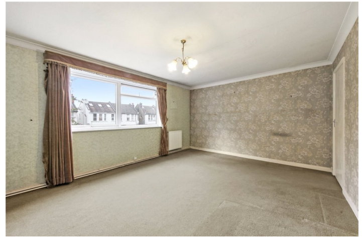
51A, PINNER ROAD, HARROW, HA1 £335,000 SHARE OF FREEHOLD