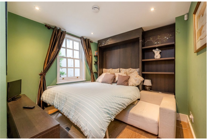
GARDEN STUDIO, OAKWORTH ROAD, LONDON, W10 £1,495 PER MONTH -ALL BILLS INCLUSIVE OF THE RENT

GORGEOUS STUDIO APARTMENT IN DESIRABLE TREE LINED RESIDENTIAL ROAD IN NORTH KENSINGTON- ALL BILLS INCLUDED.