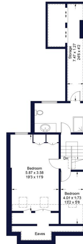
Second Floor Sq m 66.7 / Sq ft 719

Illustration for identification purposes only, measurements are approximate, not to scale. FloorplansUsketch.com © 2022 (ID866825)