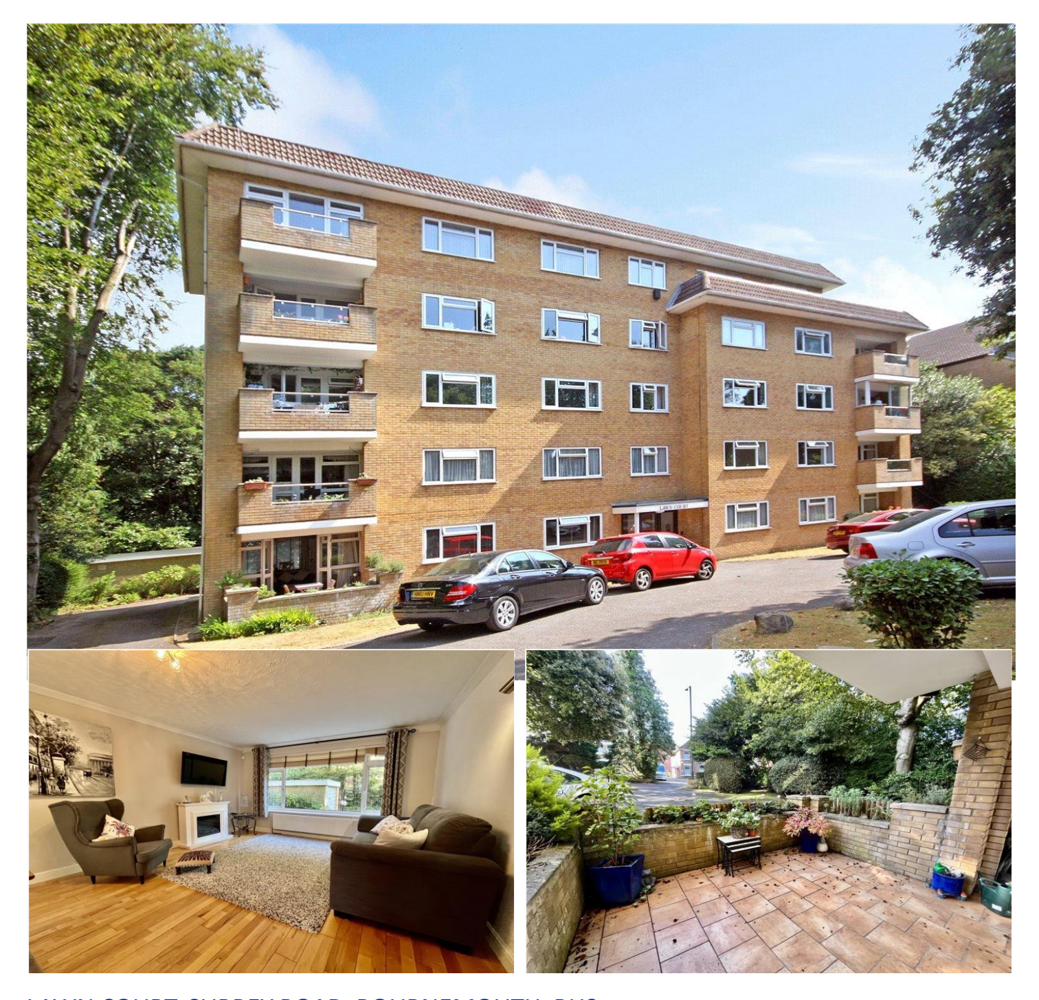
LAWN COURT, SURREY ROAD, BOURNEMOUTH, BH2