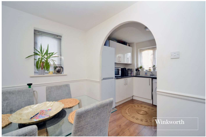
PERCY GARDENS, WORCESTER PARK, KT4 £325,000 LEASEHOLD

A BEAUTIFULLY PRESENTED TWO DOUBLE BEDROOM FIRST FLOOR APARTMENT WITH RESIDENT'S PARKING LOCATED CLOSE TO MALDEN MANOR STATION