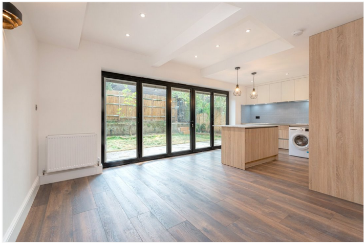
CAMBRIDGE GARDENS, W10 £5,995 PER MONTH