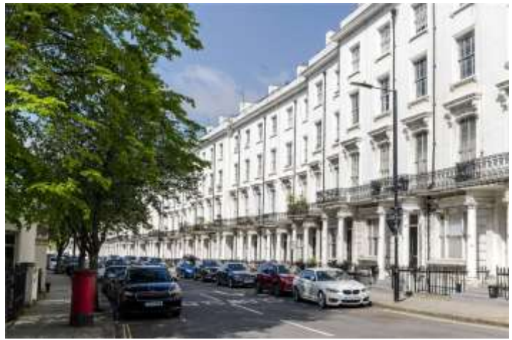
GLOUCESTER TERRACE, PADDINGTON, W2 £495,000 LEASEHOLD

A CHARMING AND LIGHT FIRST FLOOR ONE BEDROOM APARTMENT, WITH A SOUTH FACING BALCONY, FABULOUSLY HIGH CEILINGS AND ONLY A SHORT STROLL FROM THE NEIGHBOURING WESTBOURNE GROVE AND QUEENSWAY.