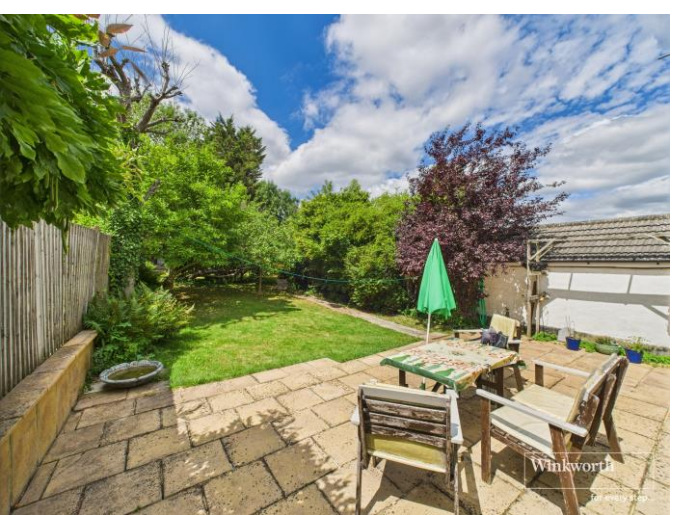
ROWSLEY AVENUE, HENDON, LONDON, NW4