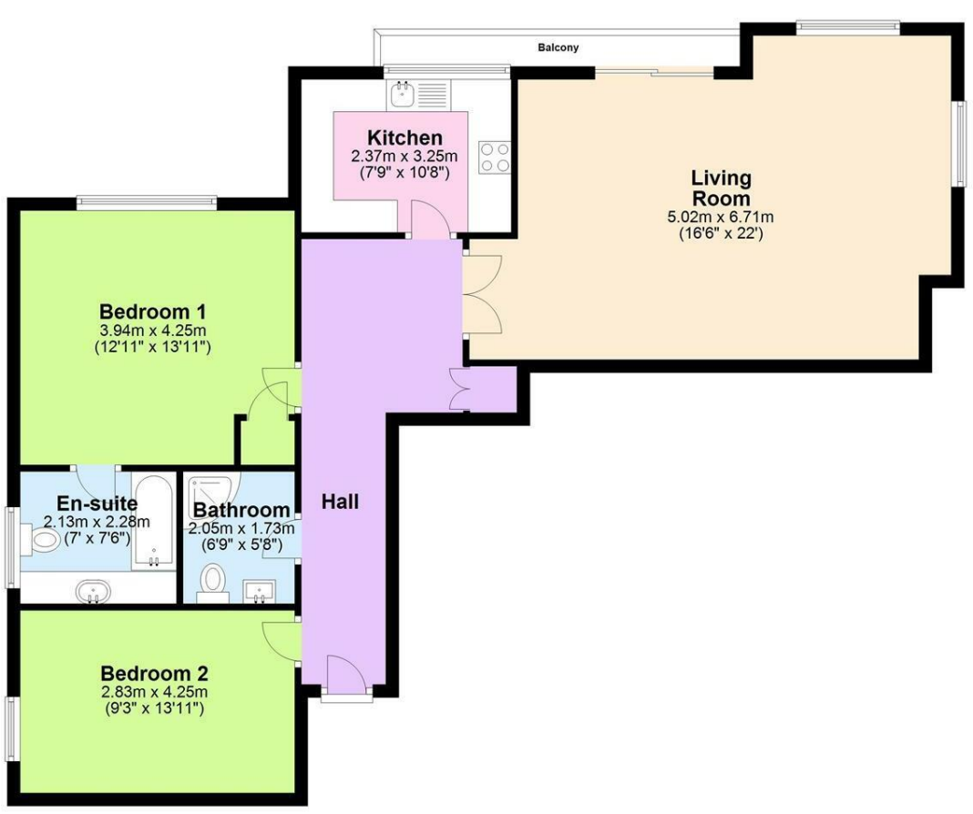
Total area: approx. 92.5 sq. metres (996.2 sq. feet)

Approx. 92.5 sq. metres (996.2 sq. feet)