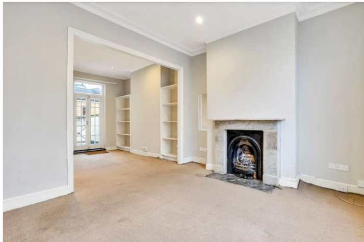
WATERFORD ROAD, SW6 £1,595,000 FREEHOLD

A well-proportioned four bedroom house spanning just over 1550 sq ft. in the heart of Fulham.