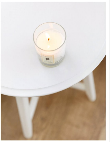
LIGHTERAGE COURT, BRENTFORD, TW8 £1,800 PER MONTH