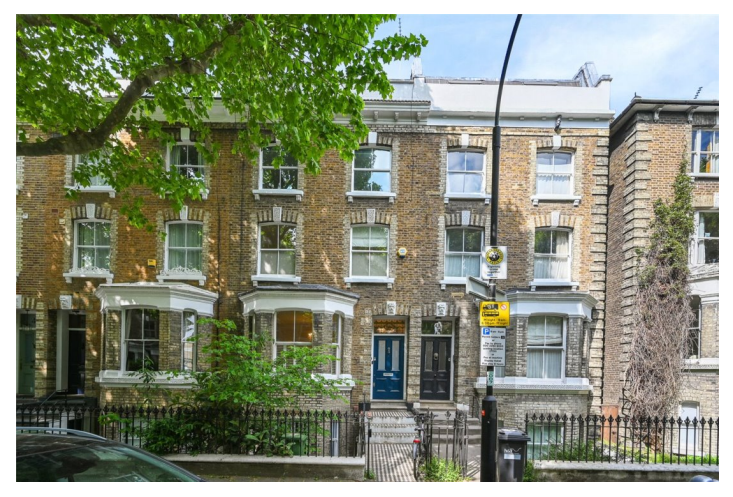
LOFTUS ROAD, W12