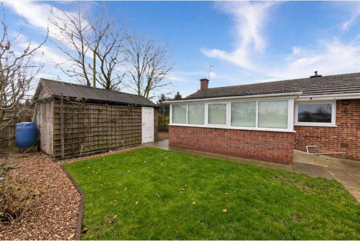
Conservatory - 13'9" x 6'3" (4.2m x 1.9m)