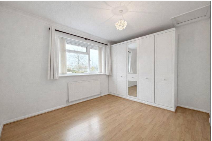
Bedroom 3 - 9' x 7'5" (2.74m x 2.26m)