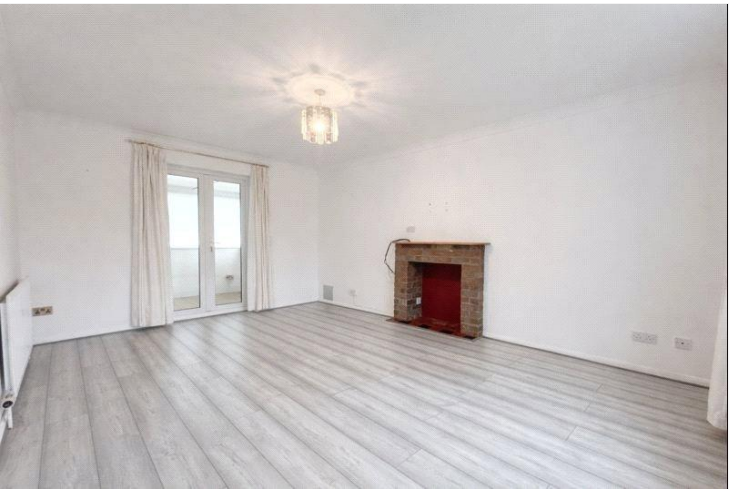
Bedroom 1 - 11'10" x 11'6" (3.6m x 3.5m)