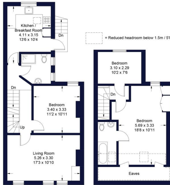
First Floor Sq m 54.2 / Sq ft 583

Approximate Gross Internal Area Total = 100.7 sq m / 1083 sq ft