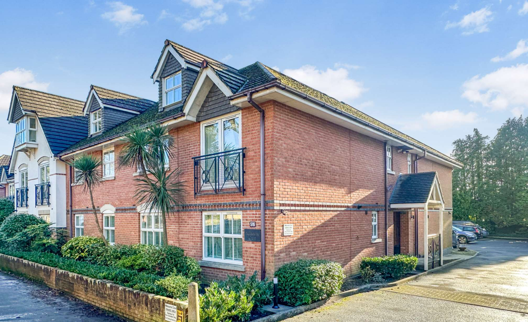
Milbourne Court Ferndown BH22 9NP GUIDE PRICE £230,000