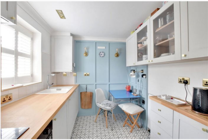
STOWAGE, LONDON, SE8 £750,000 FREEHOLD

WE ARE DELIGHTED TO OFFER THIS ABSOLUTELY STUNNING, TWO BEDROOM, MODERN TERRACED HOUSE THAT IS PART OF THIS SMALL GATED DEVELOPMENT LOCATED WITHIN GREENWICH CREEKSIDE AND JUST TO THE WEST OF THE TOWN CENTRE. PRESENTED IN PRISTINE ORDER THROUGHOUT, MEASURING CIRCA 831 SQ FT AND FEATURING OFF STREET PARKING!