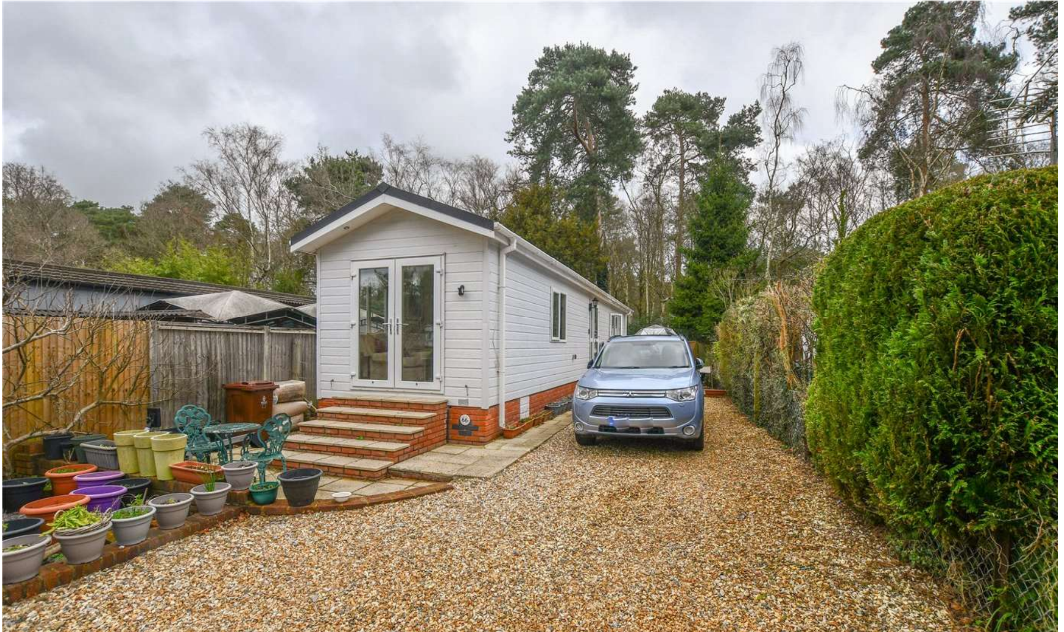
66 CALIFORNIA COUNTRY PARK HOMES, FINCHAMPSTEAD, RG40 4HT £150,000