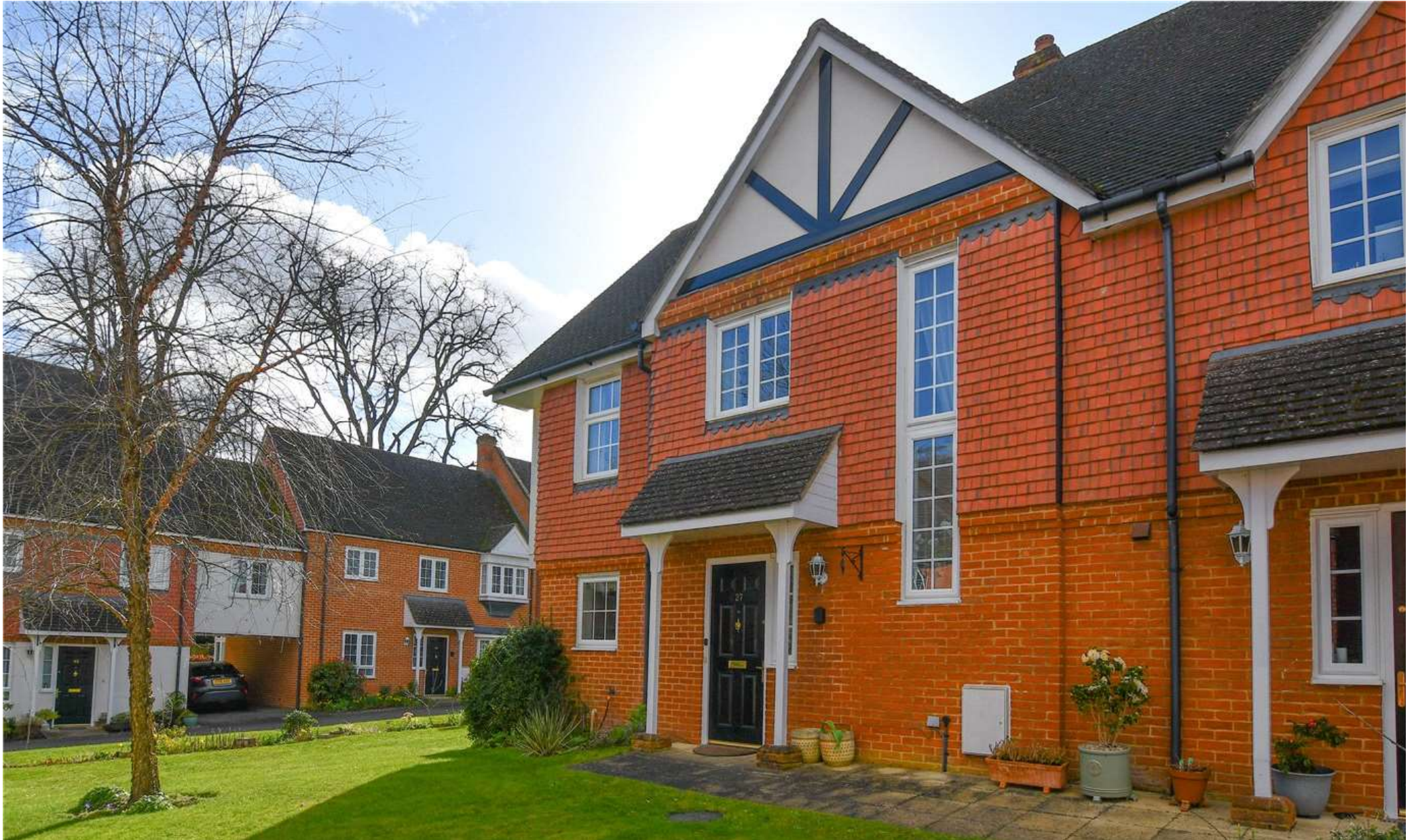
27 HARDING PLACE, WOKINGHAM, BERKSHIRE, RG40 1BX £465,000 FREEHOLD