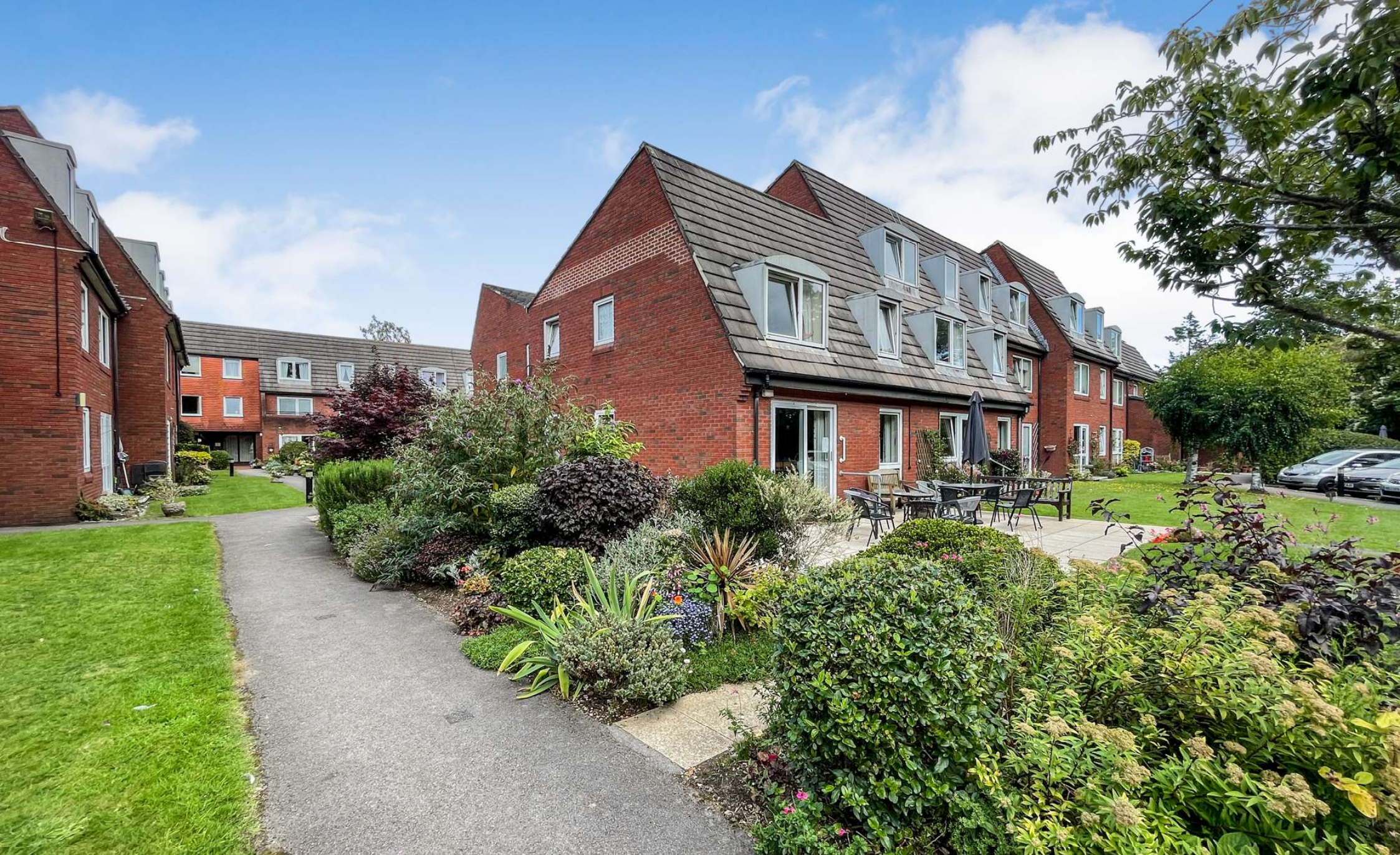
Homelands House, 535 Ringwood Road Ferndown, BH22 9DB Guide Price £60,000