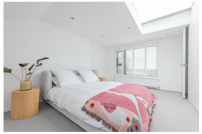
FLAT A, CLIFFORD GARDENS, LONDON, NW10 £809,950 SHARE OF FREEHOLD

CONTEMPORARY AND ARCHITECTURALLY DESIGNED, THREE DOUBLE BEDROOM, TWO BATHROOM, SPLIT LEVEL FLAT LOCATED IN THE HEART OF KENSAL RISE.