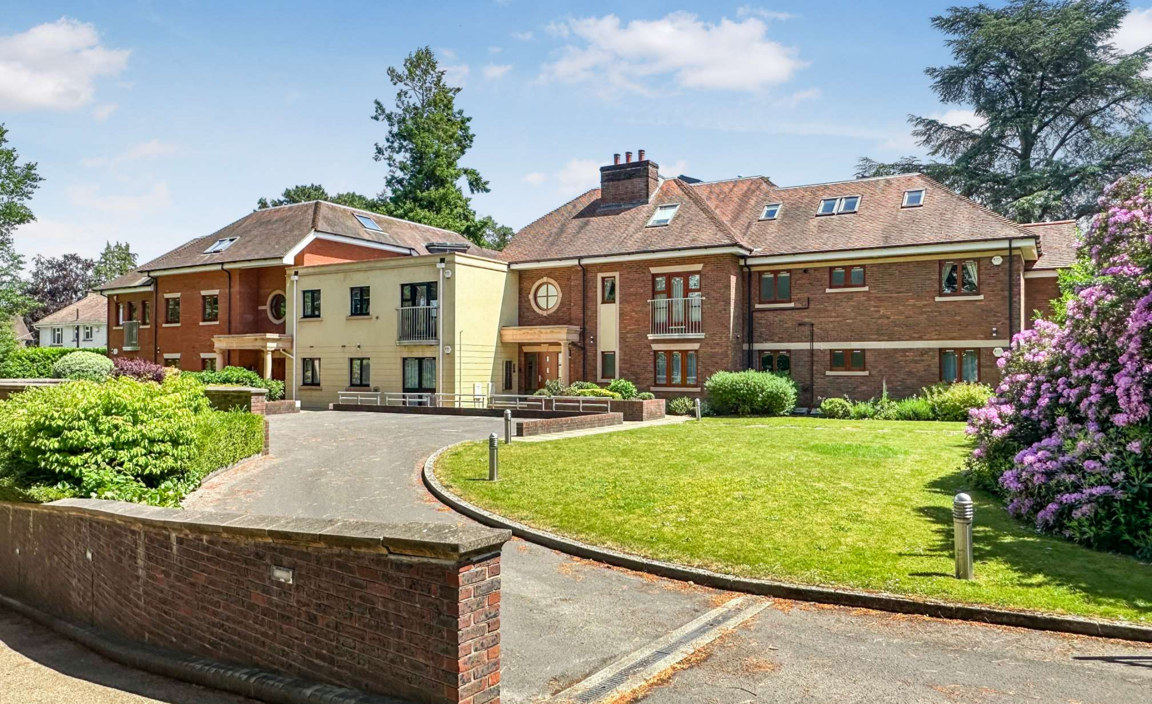
The Ferns, 90 Golf Links Road Ferndown BH22 8BZ Guide Price £475,000